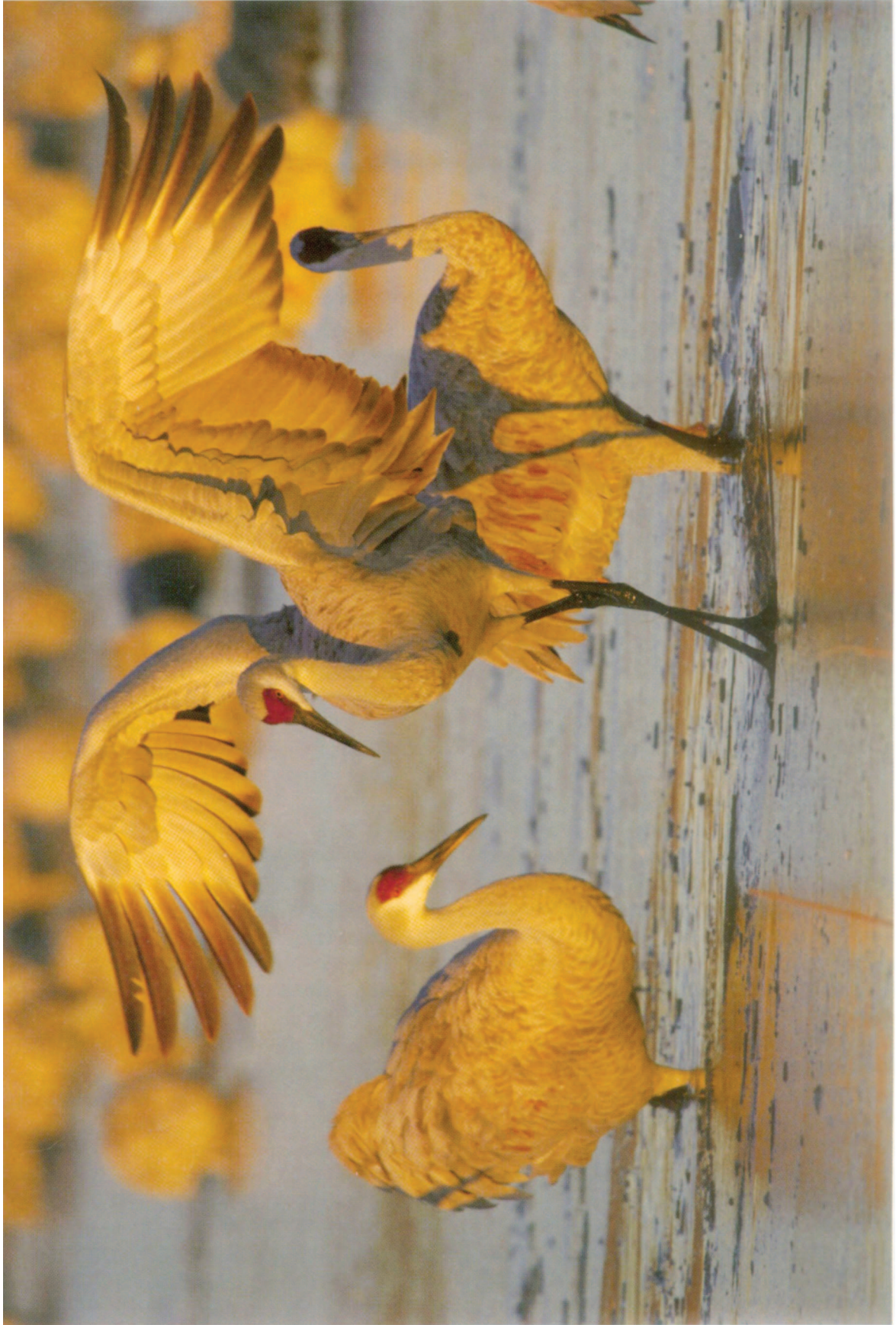
Plate 6. Sandhill Cranes ( Grus canadensis ) in Bosque Del Apache National Wildlife Refuge, New Mexico.