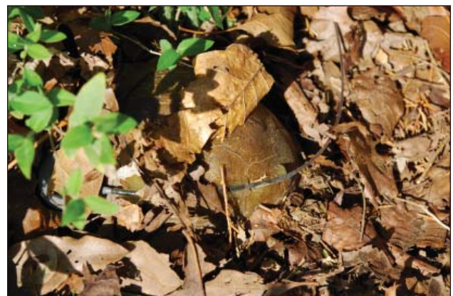
Figure 4. A Three-toed Box Turtles resting in a "form" on 27 March 2012 at the Dickinson site, Jefferson City, MO.

While the study was short (18 months), the data collected elucidates important information concerning the ecology of Three-toed Box Turtles in urban environments. Habitat use mirrored what is known