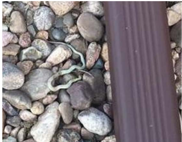
Figure 2. Juvenile T. sirtalis found in landscaping rocks at the Crane Trust Nature and Visitor's Center 10 March 2017.