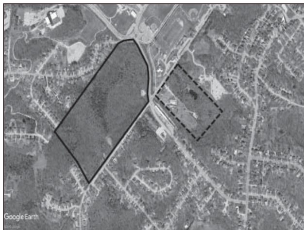
Figure 1. Aerial photograph of the two urban Three-toed Box Turtle study sites in Jefferson City, Missouri. The checked line denotes the perimeter of the Dickinson Site, and the solid line the Hill Site.

Turtles were encountered during foot searches of each site, or serendipitously while conducting radio telemetry. For each turtle encountered we recorded sex, mid-line carapace length (MCL), plastron length (PL), height, and mass. We also recorded any damage observed, or signs of attempted predation (teeth and chew marks). All individuals were given a unique mark by notching marginal scutes with a triangular file. Annuli was counted on the 3 rd and 4 th costal scutes to determine size-age relationships. While annuli have not been validated for Three-toed Box Turtles we felt the data acquired, even with some deviation, would provide information in regards to age at maturity. We calculated population size using the Chapman modification of the Lincoln-Peterson population estimator for small sample sizes (Seber, 1982), using summer of 2011 as a mark period and the summer of 2012 as the recapture period. We calculated apparent survivorship and recapture probability using Cormack-Jolly-Seber models in