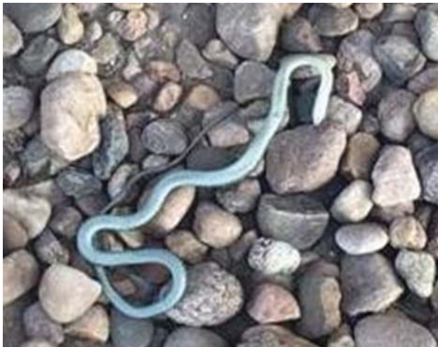
Figure 1. Adult T. sirtalis found in landscaping rocks at the Crane Trust Nature and Visitor's Center 10 March 2017.

In 2017, the second warmest February was recorded globally, with local temperatures reaching a peak of 25 °C on 21 February (NOAA 2017). This high temperature was followed by a cold snap 3 days later with temperatures as low as -9 °C. Additionally, the first week of March 2017 had temperatures averaging 12 °C, peaking on 6 March at 25 °C. Low temperatures stayed above the lethal threshold of -5.5 °C documented for T. sirtalis (Churchill and Storey 1992) until the morning of 10 March when temperatures dropped to -8 °C. It is uncertain which cold snap resulted in the death of these two snakes. T. sirtalis is known to have one of the longest active, and shortest brumation periods of all snake species in the central Great Plains (Fitch 1965), and emerge from brumation as early as mid-late February in Kansas and Missouri (Sexton and Bramble 1994; Ballinger 2010) and early March in Nebraska (Fogell 2010). T. sirtalis activity and emergence has been linked to changes in soil temperature in some studies (Wittier et al. 1987; Lutterschmidt et al. 2006). Late winter emergence may expose T. sirtalis to a potentially significant mortality risk, as temperatures retain the potential to drop well