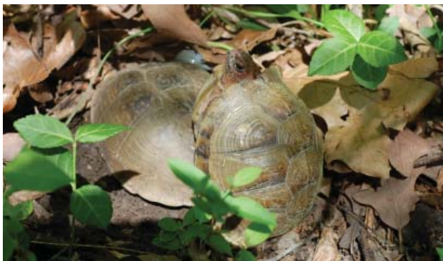
Figure 5. A telemetered female and unmarked male observed copulating on 1 April 2012, on the Dickinson site, Jefferson City, MO.

While suitable habitat is present within our urban woodplots, the small fragmented size and proximity to roads and residential developments may hinder population persistence. Home range sizes were constrained by fragment size, at least for males, and population densities were also constrained by fragment size and much lower than for wild populations. Population densities for wild Three-toed Box Turtles in Missouri ranged from 18.4-26.9/ha (Schwartz et al., 1984). Population densities for wild populations of the nominate Eastern Box Turtle ranged from 2.7-22.7/ha across their range (Dodd, 2001). Nazdrowicz et al. (2008) reported similar low densities, 0.81-3.62/ha depending on fragment size, for Eastern Box Turtles in Delaware.