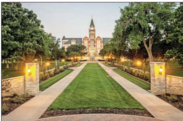
Paper sessions/Keynote - Friends University