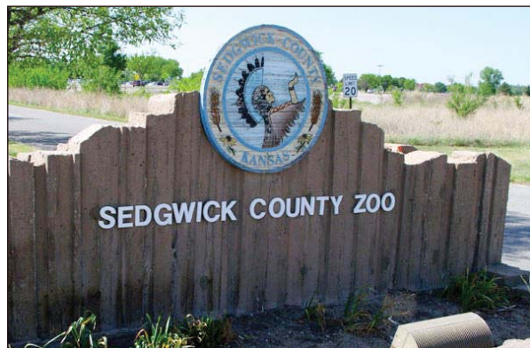
Auction - Sedgwick County Zoo