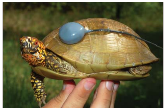
Figure 2. Transmitter placement on Three-toed Box Turtles at two sites in Jefferson City, MO.

We made 82 captures of 59 individual box turtles (34 males, 25 females, and 3 unknown sex juveniles) between 19 April 2011 and 2 August 2012. We captured more males than females, although the difference was not significant (Table 1). The population estimate for the Hill site (34 \pm 14.7; 2.3 turtles/ha) was nearly twice that of the smaller Dickinson site (18.2 \pm 5.4; 2.5 turtles/ha), although densities were nearly identical. Due to small sample sizes, we pooled all turtles from both sites to calculate survivorship and recapture