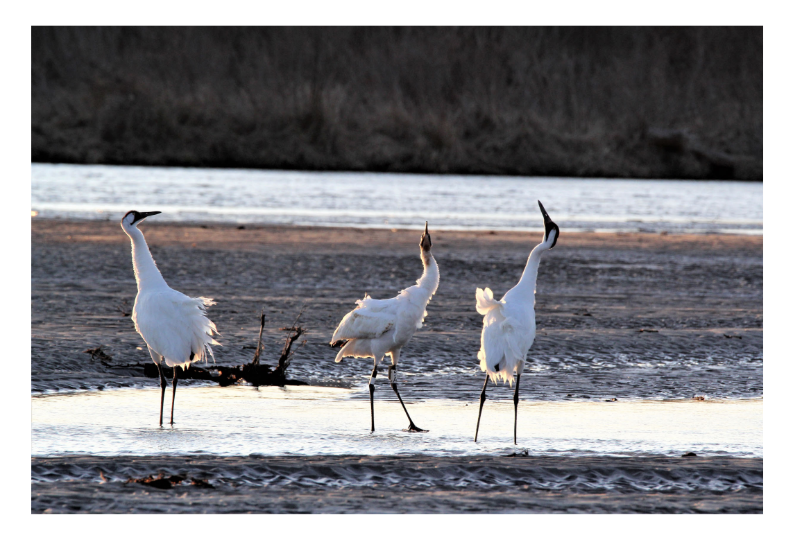
Fig. 1. A family group of Whooping Cranes ( Grus americana ) displaying alert behavior as a 2-year-old Bald Eagle ( Haliaeetus leucocephalus ) hovers overhead on 27 March 2018 within the main channel of the Middle Loup River, Sherman County, Nebraska, USA.

brief and the attempted depredation was unsuccessful as the attacked adult WHCR engaged with the BAEA, utilizing an agonistic "attack and mob" behavior termed a "jump-rake" by Ellis et al. (1998) and Heatley (2002). The WHCR leaped into the air with its wings spread wide and met the BAEA, slashing at its opponent with its talons (Fig. 2). The BAEA is believed to have made brief physical contact with the crane's wing, though neither bird exhibited signs of injury.